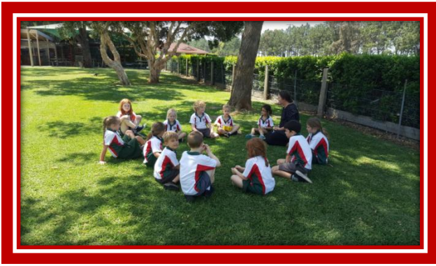
The wattles are busy using dice to develop their automaticity in recalling facts to 12.