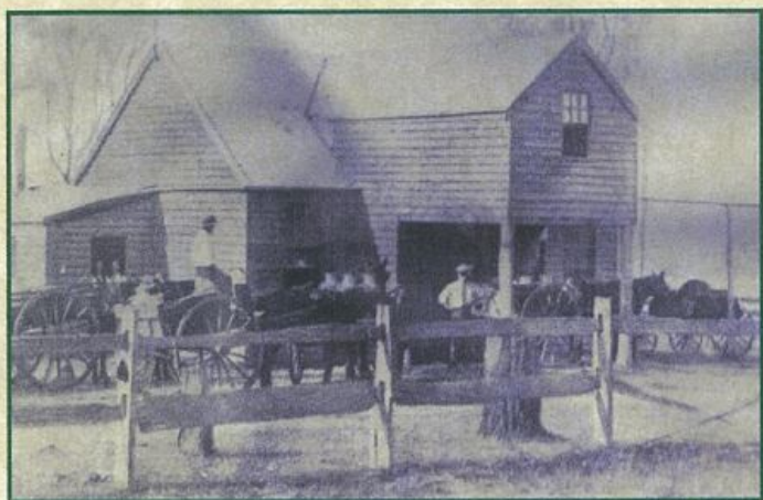
Osterley Creamery ~ site of the original school